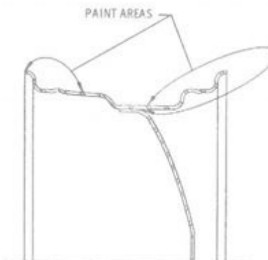
FIG. 2 P05 WHEEL ONLY

NOTE: WHEELS ARE TO BE PAINTED EBONY BLACK ENAMEL WITH WHEEL DISCS.